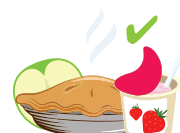
A dessert, piece of fresh fruit or an organic yoghurt